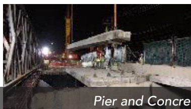
Pier and Concrete Beam Removal